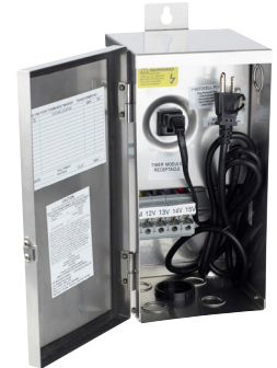
MAGNETIC TRANSFORMER shown in stainless steel