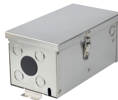
MAGNETIC TRANSFORMER shown in stainless steel

* Visit techlighting.com for specific warranty limitations and details.