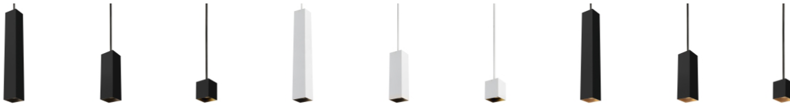
matte black / black 36" matte black / black 18" matte black / black 6" matte white / black 36" matte white / black 18" matte white / black 6" matte black / gold haze 36" matte black / gold haze 18" matte black / gold haze 6"