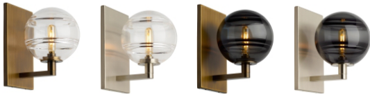
clear / aged brass