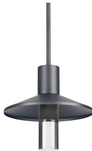
ASH PENDANT shown in charcoal/clear cylinder

* Visit techlighting.com for specific warranty limitations and details.