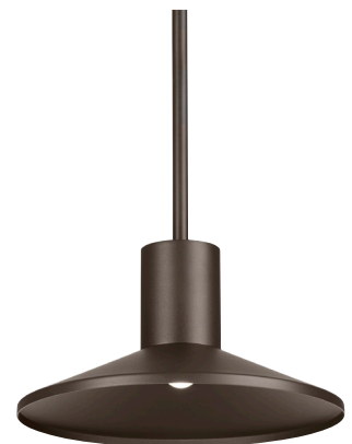
ASH PENDANT shown in bronze/clear lens