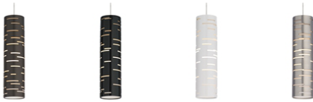
antique bronze gloss black gloss white satin nickel