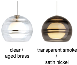
clear / aged brass