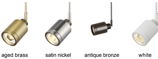
aged brass satin nickel antique bronze white