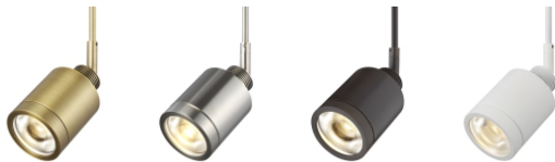
aged brass satin nickel antique bronze white