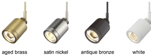
aged brass satin nickel antique bronze white