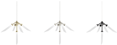
frost/aged brass frost/satin nickel frost/matte black