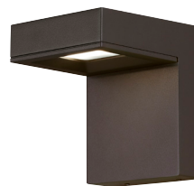
TAAG 6 shown in bronze

* Visit techlighting.com for specific warranty limitations and details.