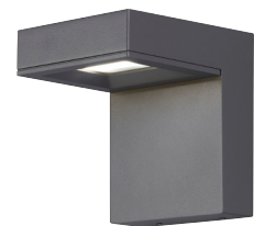
TAAG 6 shown in charcoal