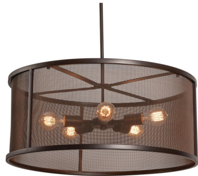
Shown in bronze / copper

The Austin Pendant features construction that has a copper mesh screen with a Bronze finish. Ideal for use in hallways, entrances or wherever general lighting is needed. Mounts to standard junction box, mounting holes and hardware are included. Includes a 3ft. adjustable rigid stem, expandable up to 9ft.