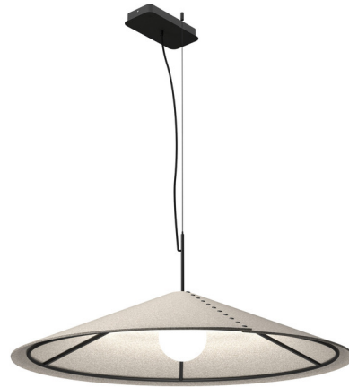
Shown in black / off white

The BuzziCone Pendant is the original noise-reducing light from BuzziSpace that offers elegant decorative lighting while also helping reduce the noise in your room. The pendant's felt construction helps to absorb sound, making it perfectly suited for use in large spaces with unwanted echoes or ambient noise.