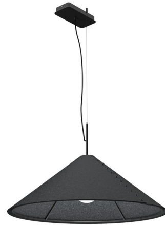
Shown in black / anthracite

The BuzziCone Pendant is the original noise-reducing light from BuzziSpace that offers elegant decorative lighting while also helping reduce the noise in your room. The pendant's felt construction helps to absorb sound, making it perfectly suited for use in large spaces with unwanted echoes or ambient noise.