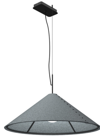
Shown in black / stone grey

The BuzziCone Pendant is the original noise-reducing light from BuzziSpace that offers elegant decorative lighting while also helping reduce the noise in your room. The pendant's felt construction helps to absorb sound, making it perfectly suited for use in large spaces with unwanted echoes or ambient noise.