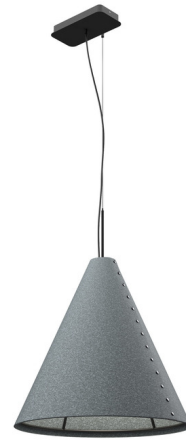
Shown in black / stone grey

The BuzziCone Pendant is the original noise-reducing light from BuzziSpace that offers elegant decorative lighting while also helping reduce the noise in your room. The pendant's felt construction helps to absorb sound, making it perfectly suited for use in large spaces with unwanted echoes or ambient noise.