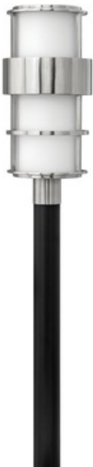
Shown in: Stainless Steel / Etched Opal

The Saturn 120V Outdoor Post Mount features an Etched Opal glass diffuser with a Stainless Steel finish. Post fitter is 3 inches in diameter. Post not included. Hinkley post lights are compatible with two types of base; order either a pier mount fitter or post depending on the application.Note: LED option is Title 24 Compliant.