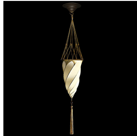
Shown in brass / ivory plain silk

Inspired by the enduring elegance of ancient sanctuary lamps, the Cesendello Silk Pendant brings a timeless allure to your space. Handcrafted in Italy, this exquisite suspension features a pure silk shade, available in either classic Ivory Classic or serene Ivory Plain. It's gracefully appointed with a sophisticated brass finish and a deep dark brown canopy, ensuring a refined aesthetic from every angle. The Cesendello Silk Pendant is more than just a light source; it's a piece of art that blends traditional craftsmanship with contemporary sensibility. Perfect for creating an intimate glow in dining areas, adding a touch of global sophistication to living rooms, or enhancing the tranquility of a bedroom. Note: The overall height is not adjustable and must be specified at the time of order to ensure a perfect fit for your space. Minimum/Maximum Height: 37.38 in. / 45.25 in.