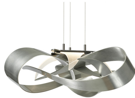
Shown in sterling

PRODUCT DIMENSIONS . . . . . Min/Max Adjustable Length: 17" - 106" COLOR RENDERING . . . . . 90 CRI LAMP COLOR . . . . . 3000K LUMENS/WATT . . . . . 30.43 LUMINOUS FLUX . . . . . 700 lumens