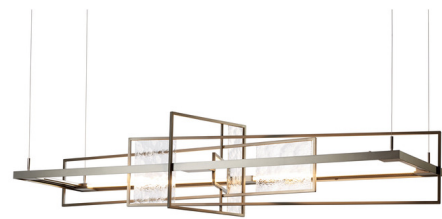
Shown in dark smoke / aqualite glass

PRODUCT DIMENSIONS . . . . . Adjustable Min/Max Overall Height: 18" - 100" COLOR RENDERING . . . . . 90 CRI LAMP COLOR . . . . . 3000K LUMENS/WATT . . . . . 32.50 LUMINOUS FLUX . . . . . 1560 lumens