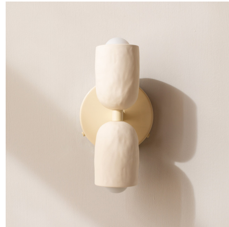
Shown in bone canopy / white clay upper shade

The petite and unobtrusive Ceramic Up Down Wall Sconce emits a soft glow of light up and down the wall. Each ceramic shade is handmade and left raw or pigmented. Available in 175 shade and canopy finish options. Can be mounted vertically or horizontally. Includes Warm Dim bulb which changes in color from 3000K to 2200K as it is dimmed. Please select a canopy finish, an upper shade color, and a lower shade color.