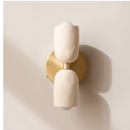
Shown in brass canopy / white clay upper shade

The petite and unobtrusive Ceramic Up Down Wall Sconce emits a soft glow of light up and down the wall. Each ceramic shade is handmade and left raw or pigmented. Available in 175 shade and canopy finish options. Can be mounted vertically or horizontally. Includes Warm Dim bulb which changes in color from 3000K to 2200K as it is dimmed. Please select a canopy finish, an upper shade color, and a lower shade color.