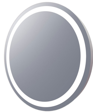
Shown in white / mirror

COLOR RENDERING . . . . . 90 CRI LAMP COLOR . . . . . 3000K LUMENS/WATT . . . . . 130.19 LUMINOUS FLUX . . . . . 7681 lumens