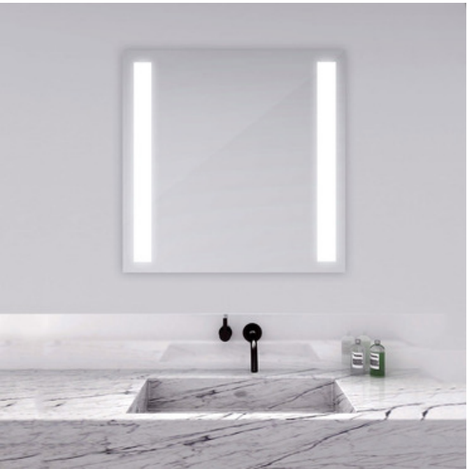
Shown in: Mirror

The Fusion Square Lighted Mirror is designed to maximize direct illumination. Ideal for precision tasks such as makeup application and shaving. White powder coated chassis for finished side view. Corrosion resistant OmegaMirror glass. Choice of standard forward phase control or with Ava dimming. Ava Smart Look technology features tunable white LED lights that allow you to select the color temperature. Select between 6500K for a day of outdoor activities, 4600K for your daily routine, or 2700K for a night out on the town. Tap to Cycle through 2700K, 4600K, 6500K, Night Glow and Off. At every level, hold to dim down to 10%. After one hour of non-use, Energy Save Mode automatically dims lights to 10%.Note: The Fusion mirror must be installed in the W x H (width x height) orientation as listed; it cannot be installed in any other direction.