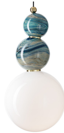
Shown in matte black / lithyalin

PRODUCT DIMENSIONS . . . . . Cord Length: 78.75" COLOR RENDERING . . . . . 90 CRI LAMP COLOR . . . . . 2700K LUMENS/WATT . . . . . 80.00 LUMINOUS FLUX . . . . . 800 lumens