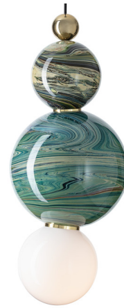
Shown in matte black / lithyalin

PRODUCT DIMENSIONS . . . . . Cord Length: 78.75" COLOR RENDERING . . . . . 90 CRI LAMP COLOR . . . . . 2700K LUMENS/WATT . . . . . 90.00 LUMINOUS FLUX . . . . . 450 lumens