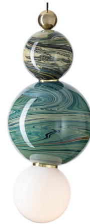
Shown in matte black / lithyalin

PRODUCT DIMENSIONS . . . . . Cord Length: 78.75" COLOR RENDERING . . . . . 90 CRI LAMP COLOR . . . . . 2700K LUMENS/WATT . . . . . 90.00 LUMINOUS FLUX . . . . . 450 lumens