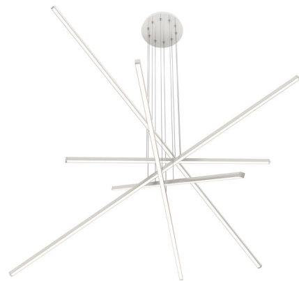
Shown in satin nickel / diffused lens

PRODUCT DIMENSIONS . . . . . Cable Length: 12 Feet LAMP LIFE . . . . . 50000 hours LAMP COLOR . . . . . 2700K LUMENS/WATT . . . . . 178.80 LUMINOUS FLUX . . . . . 894 lumens