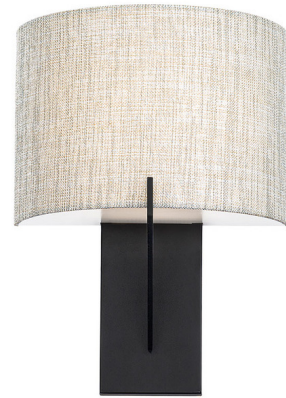
Shown in black / clear