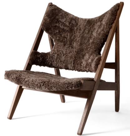
Shown in dark stained oak / root sheepskin

The Knitting Chair is defined by the exposed triangular construction and gently curved seat with a high back that is pitched for relaxation. Cut outs in the back ensure that your arms are comfortable while reading a book, or even knitting.