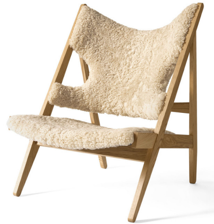
Shown in natural oak / natural sheepskin

The Knitting Chair is defined by the exposed triangular construction and gently curved seat with a high back that is pitched for relaxation. Cut outs in the back ensure that your arms are comfortable while reading a book, or even knitting.