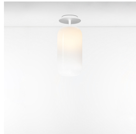
Shown in white / white

Designed by the innovative Bjarke Ingels Group (BIG), the Gople Semi Flush Ceiling Light is an exquisite fusion of ancient craftsmanship and contemporary aesthetic. This ceiling fixture brings the timeless beauty of hand-blown glass into a modern, elevated form, creating a unique focal point in any room. At its heart is a distinct pill-shaped, hand-blown glass diffuser, crafted meticulously according to ancient Venetian techniques in Murano. The inherent artistry of this glass ensures that each piece possesses its own subtle, unique character. The elegant shape of the glass is expertly designed to diffuse a soft, uniform glow throughout your space, fostering a comfortable and serene ambiance. Available in a variety of finish and shade options and in two sizes, each configuration of the Gople Semi Flush Ceiling Light adds a stylish and sophisticated touch, seamlessly integrating into Contemporary, Traditional/Classic, and Transitional interiors.