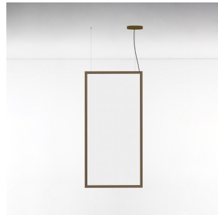
Shown in bronze / transparent

COLOR RENDERING . . . . . 90 CRI LAMP COLOR . . . . . 3000K LUMENS/WATT . . . . . 85.15 LUMINOUS FLUX . . . . . 4002 lumens