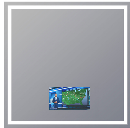
Shown in mirror

COLOR RENDERING . . . . . 90 CRI LAMP COLOR . . . . . 3000K LUMENS/WATT . . . . . 99.82 LUMINOUS FLUX . . . . . 10880 lumens