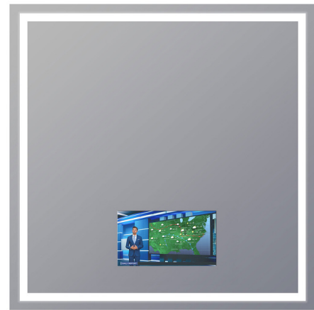
Shown in mirror