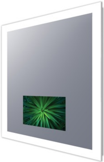
Shown in: Frosted

The Silhouette Lighted Mirror with 15 inch TV provides a soft halo of light glowing around the perimeter of the mirror. Diffusers on the outside provide for a softer glow. Choice of 15.6 or 21.5 inch LED HDTV with HDMI, RF and component connections. Integrated speakers for high quality stereo sound. Electric Mirror's Spectrum Mirror TVs are best suited for bathrooms that are not overly bright. When the TV is off, the screen area is camouflaged, leaving only a light gray image where the TV is located. Waterproof remote included. Note: Silhouette can only be hung in the W x H orientation as shown; fixture is not field-interchangeable