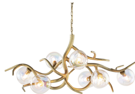
Shown in brass burnished / iridescent

PRODUCT DIMENSIONS . . . . . Adjustable Chain Length: 66.9"