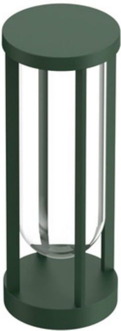
Shown in: Forest Green / Transparent

The In Vitro Bollard Light is an elegant option for outdoor lighting that modernizes the classic lantern into a contemporary structure blending craftsmanship and technology into a new design. A concealed LED light source is magically lit and warmly emanates through the slim glass dome shade creating an atmospheric glow. Available in three sizes with a White, Anthracite, Black, Deep Brown, Forest Green, Terracotta, or Pale Green finish. Non-Dimmable or 0-10V dimming options available, as well as a choice of 3000K or 2700K light color temperature. UL listed, wet locations.