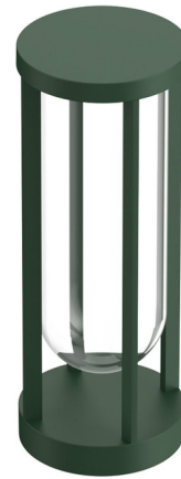
Shown in forest green / transparent