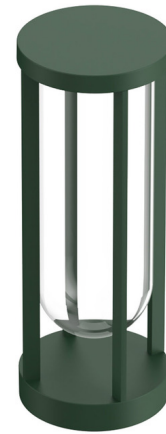
Shown in forest green / transparent

BEAM ANGLE . . . . . 111° COLOR RENDERING . . . . . 80 CRI LAMP COLOR . . . . . 2700K LUMENS/WATT . . . . . 104.55 LUMINOUS FLUX . . . . . 1150 lumens