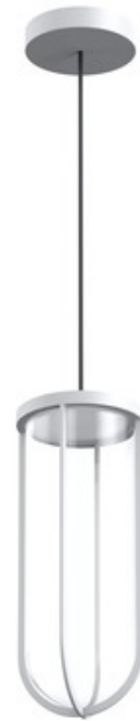
Shown in: White / Transparent

The In Vitro Pendant is an elegant option for outdoor lighting that modernizes the classic lantern into a contemporary structure blending craftsmanship and technology into a new design. A concealed LED light source is magically lit and warmly emanates through the slim glass dome shade creating an atmospheric glow. Available with a White, Anthracite, Black, Deep Brown, Forest Green, Terracotta, or Pale Green finish. Non-Dimmable or 0-10V dimming options available, as well as a choice of 3000K or 2700K light color temperature.