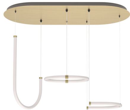
Shown in brass / white