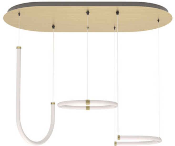
Shown in: Brass / White

The Unseen 3 Pendant floats with modular beauty and boasts sophisticated technology. Curved polycarbonate tubes that are integrated with LEDs give the Unseen its sleek and contemporary profile. Make a statement in your home or in a commercial space with this beautiful luminaire. CE and UL listed.