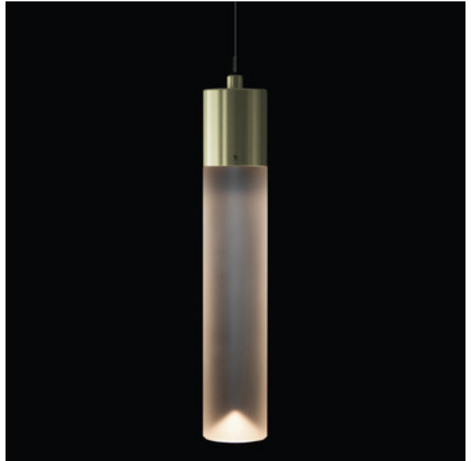
Shown in: Anodized Champagne / Satin

The P1 Pendant is a high-efficiency LED luminaire with a machined aluminum housing and an acrylic TIR light control lens. Choice of 2700K or 3000K color temperature. Available with a 4.25 inch round Standard Canopy or 6.5 inch x 7.5 inch hexagonal Configurate Canopy. Configurate offers designers the opportunity to create unique compositions across the ceiling plane. Create custom compositions with perfectly placed hexagonal canopies. Note: Includes remote power supply which powers one to eight fixtures.