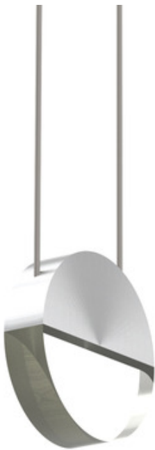
Shown in: Anodized Silver

Balance P1 consists of a sleek acrylic disc nestled in a machined aluminum housing. The acrylic lens features a frosted edge which emits glare-free warm light. Install alone or in a group. Includes 20W remote mounted electronic driver suitable to operate 1 to 8 Archilume pendants. Suitable for remote mounting up to 25 feet.