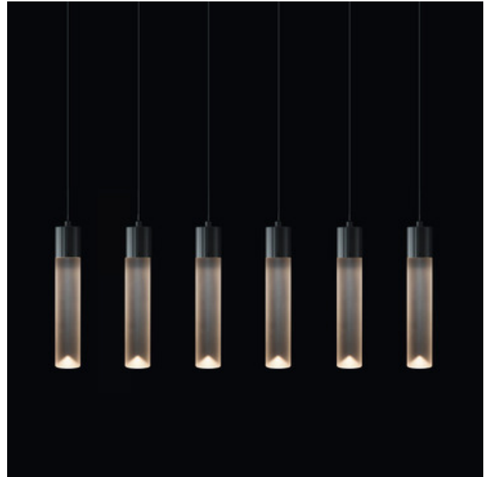
Shown in: Anodized Silver / Satin

The LED Linear Multi-Light Pendant provides a clean layer of flattering illumination with this linear pendant configuration. Archilume P6L, P8L, and P11L hide a visionary development in the use of energy-saving LEDs. The light source itself is not visible, each acrylic diffuser spreads pleasant, warm and elegant lighting that instantly enhances the space it resides in. This dimmable luminaire is ideal for creating feature accent lighting above kitchen islands and dining areas. Available with six, eight, or eleven pendants. Choice of 2700K or 3000K color temperature. Anodized Aluminum pendant finish with Clear or Satin diffuse lens optic. Integral LED driver in canopy.