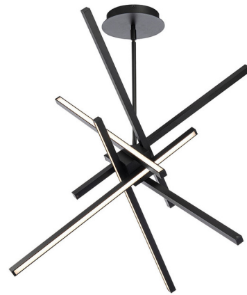
Shown in black / white