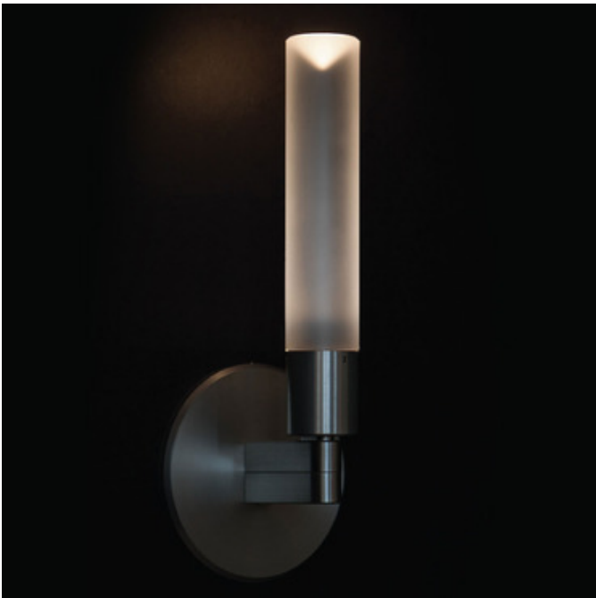
Shown in: Anodized Silver / Satin

The W1 Wall Sconce is a decorative wall mounted luminaire with a machined aluminum housing and acrylic TIR light control lens with standard diffuse optics. Includes 120 volt LED module and 700mA constant current remote driver with 0-10V dimming. Fixture mounts directly to a 4 inch junction box. Note: Included power supply needs to be placed in a remote location