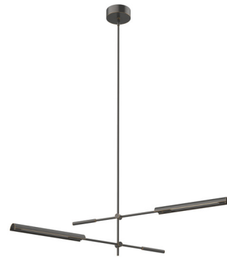
Shown in urban bronze / clear

PRODUCT DIMENSIONS . . . . . Rod Length: 46" Max (3x12" + 1x6" + 1x4"), 0.5in Dia COLOR RENDERING . . . . . 90 CRI LAMP COLOR . . . . . 2700K LUMENS/WATT . . . . . 126.00 LUMINOUS FLUX . . . . . 1260 lumens