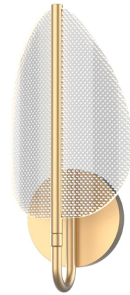
Shown in brass / clear

COLOR RENDERING . . . . . 90 CRI LAMP COLOR . . . . . 3000K LUMENS/WATT . . . . . 85.00 LUMINOUS FLUX . . . . . 340 lumens