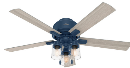
Shown in indigo blue / light gray oak

The Hartland Low Profile Ceiling Fan was design to fit flush in rooms with ceilings less than 9ft. high with a range of colors that will fit in perfectly for homes with a farmhouse or rustic look. The whisper quiet motor has three speeds and is reversible for optimal performance in summer and winter and is built with the SureSpeed Guarantee to deliver faster airflow you can feel. Available in 44in. and 52in. blade spans with a Indigo Blue, Noble Bronze, or Matte Silver motor complemented by Light Grey Oak blades. Includes an integrated light kit which includes LED Edison style light bulbs and seeded glass diffusers. Pull Chain operated. ETL listed.