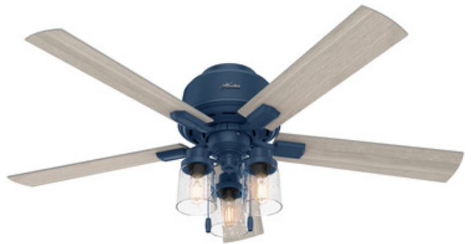
Shown in: Indigo Blue / Light Gray Oak

The Hartland Low Profile Ceiling Fan was design to fit flush in rooms with ceilings less than 9ft. high with a range of colors that will fit in perfectly for homes with a farmhouse or rustic look. The whisper quiet motor has three speeds and is reversible for optimal performance in summer and winter and is built with the SureSpeed Guarantee to deliver faster airflow you can feel. Available in 44in. and 52in. blade spans with a Indigo Blue, Noble Bronze, or Matte Silver motor complemented by Light Grey Oak blades. Includes an integrated light kit which includes LED Edison style light bulbs and seeded glass diffusers. Pull Chain operated. ETL listed.