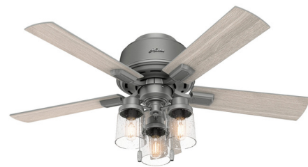
Shown in matte silver / light gray oak

The Hartland Low Profile Ceiling Fan was design to fit flush in rooms with ceilings less than 9ft. high with a range of colors that will fit in perfectly for homes with a farmhouse or rustic look. The whisper quiet motor has three speeds and is reversible for optimal performance in summer and winter and is built with the SureSpeed Guarantee to deliver faster airflow you can feel. Available in 44in. and 52in. blade spans with a Indigo Blue or Matte Silver motor complemented by Light Grey Oak blades. Includes an integrated light kit which includes LED Edison style light bulbs and seeded glass diffusers. Pull Chain operated. ETL listed.