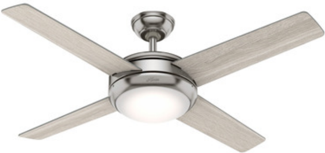
Shown in: Brushed Nickel / Light Gray Oak

The Marconi Ceiling Fan features a sleek and modern design that is perfect for a home with a transitional home decor scheme. Four blades at set at a 12 degree pitch and a 52 inch span is complemented by a powerful 153x15mm three speed reversible motor with WhisperWind technology that gives you the airflow you desire without the unwanted noise. A three position mounting system allows for mounting on Low, Sloped, or Standard ceilings. Available with a Brushed Nickel motor and Light Gray blades or a Black motor with Salted Black/Matte Black reversible blades. Includes a Wall control for easy speed and lighting adjustments as well as a 2in. and 4in. downrod. ETL listed.