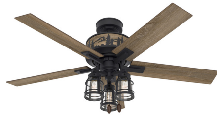
Shown in natural iron / drift oak

The Mt. Vista Ceiling Fan features a rustic style with an intricate design on the body of the fan complemented by pine cone pull chains. The three speed WhisperWind motor gives you optimal amounts of airflow without the unwanted noise as well as a reversible function allowing it to be used year round. Available with a Natural Iron motor complemented by Drift Oak blades. Includes a 3in. and 2in. downrod. Pull Chain operated. ETL listed.