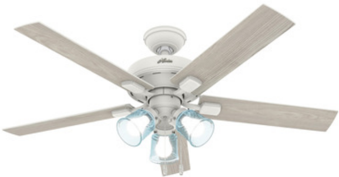
Shown in: Matte White / Bleached Oak

The Whittier Ceiling Fan with Light is the perfect addition to a home with a coastal or nautical theme due to the beautiful blue seeded glass shades that enhance the look of the fan. The five blades are set at a 13 degree pitch and 52 inch span complemented by a WhisperWind motor that provides you with the airflow you desire without the unwanted noise. Available with a Matte White motor complemented by Bleached Oak blades. Includes a 2in. and 4in. downrod. Pull chain operated for quick and easy lighting and speed adjustments. ETL listed.