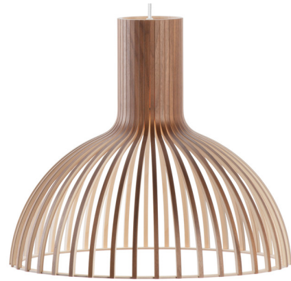
Shown in walnut birch